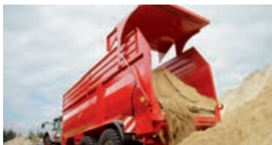
Also high density bulk materials (such as sand, lime, pebbles or compost), can be loaded or unloaded without any problems.

During the last years, Krampe has again and again developed niche products and brought them to production standards. Also many innovative details (e.g. such as the hydraulic tailgate equipped with self-adjusting hooks) are in the meantime standards in the construction of agricultural vehicles.