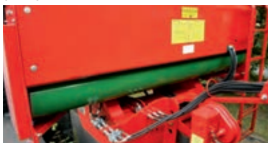
Powerful hydraulic motors at the front and at the rear walls roll the conveyor belt forwards or backwards, depending on the loading process.