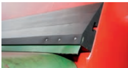
Sealing lips on the lateral sidewalls make sure that no transported good penetrates in the conveyor belt guiding device.