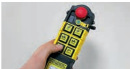
The standard remote control possesses not only a manual function, but also an automatic one, in order to facilitate repeated operating sequences (i.e. repeated loading or unloading).