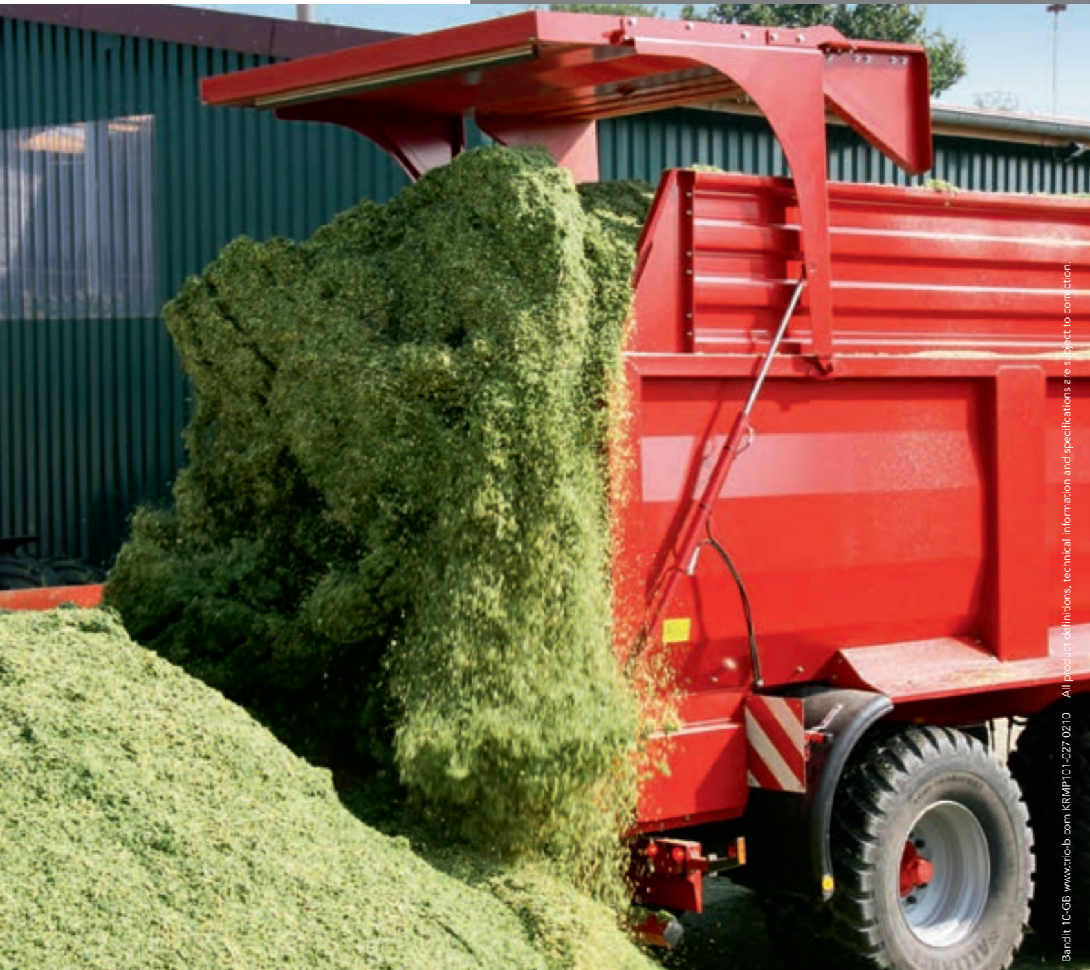
Bandit 10-GB www.trio-b.com KRAMP101-027 0210 All product definitions, technical information and specifications are subject to correction.